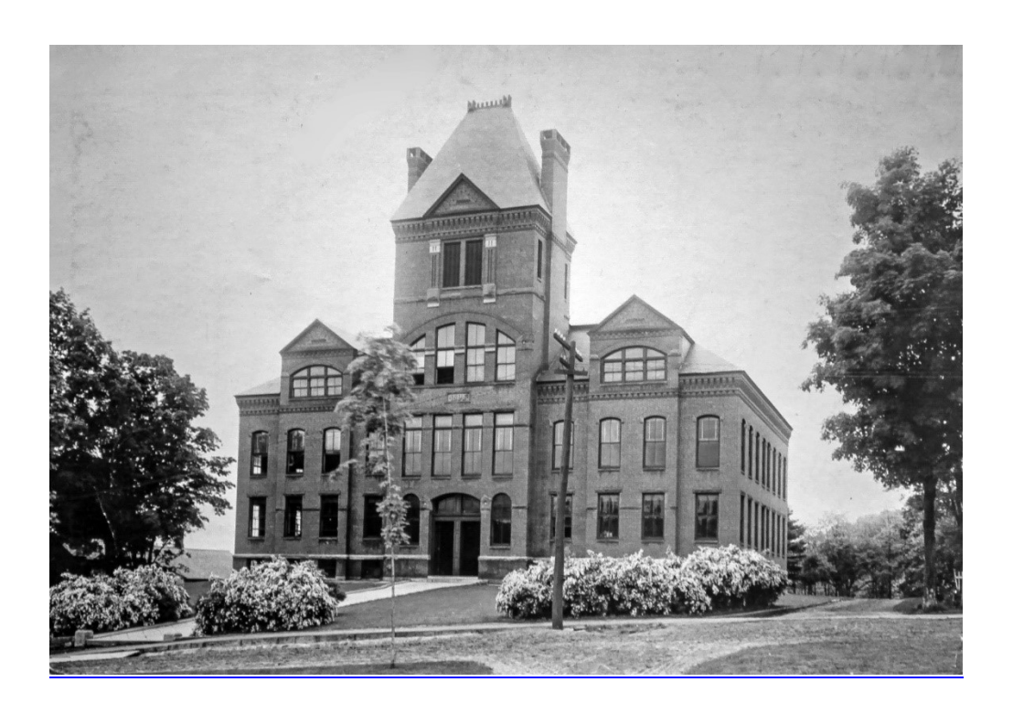
Park Street School opened April 12, 1895.

lkKVmlowMbPKxbaEJ2I#v=onepage&q=springfield%20vermont&f=false